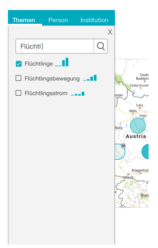
Figure 2: Filter Sidebar: Representation of the filter with the integrated sparklines showing the relevance of the results, calculated by the frequency of the topics incidence, people or institutions over the selected legislative period.